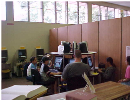
Internet Stations in use